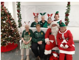
East Hanover Lions help with Park & Rec Breakfast with Santa