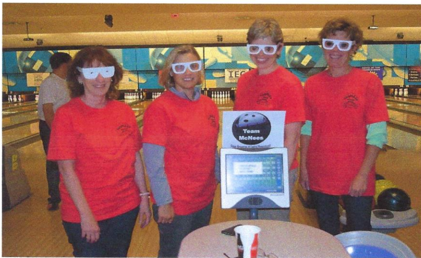
2019 Team McNees

This year the event continues to grow. The competition will begin with a warm up game for everyone and the second game will be the challenge game for all the marbles: everyone competing is required to bowl wearing one of the four special glasses that emulate the major eye diseases . It can be a tricky task to win a trophy, but there is guaranteed to be some humorous trash talk and fun for everyone participating to keep the evening lively and enjoyable.