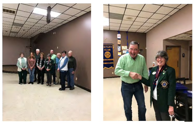
Mercersburg Lions visit and installation of new members

Visit with wonderful group of Mt. Parnell Lions.