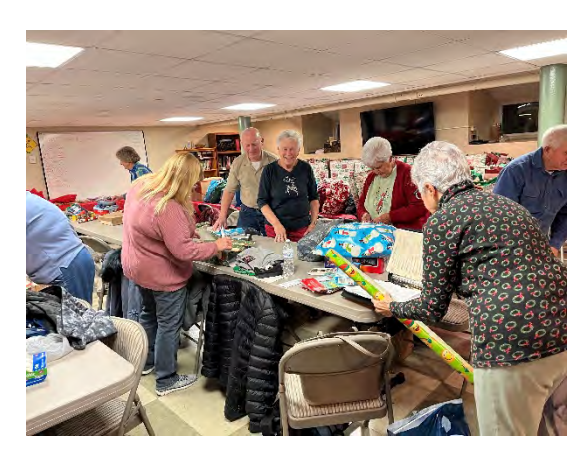
Pictured are East Hanover Lions wrapping the gifts.