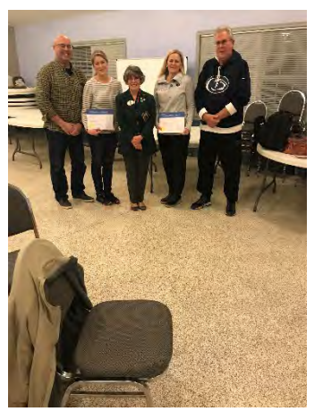
New member induction Middle Paxton Lions Club