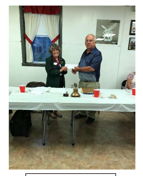
Path Valley Lions Club