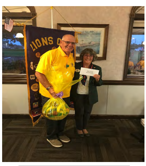
Green Township Lions Club