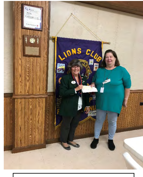
Lurgan Township Lions Club