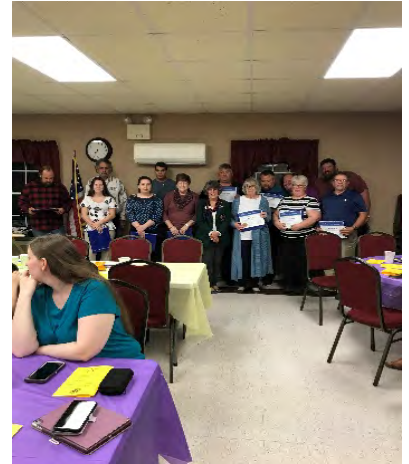
Induction of 13 new members at Marysville Lions Club