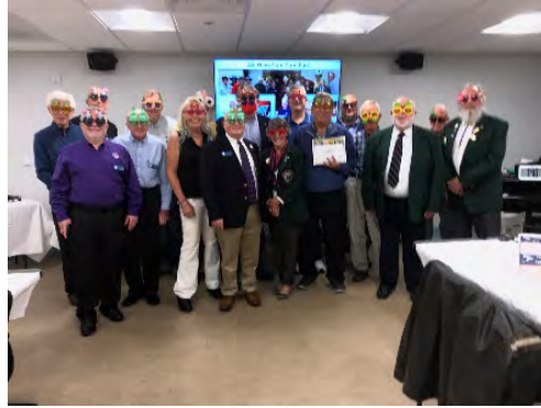
Chambersburg Evening Lions celebrating collection of 100,000+ pairs of glasses for recycling