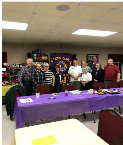
Marysville lions club visit with officers and Board