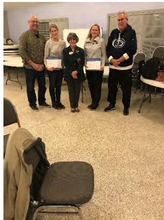
New member induction Middle Paxton Lions Club