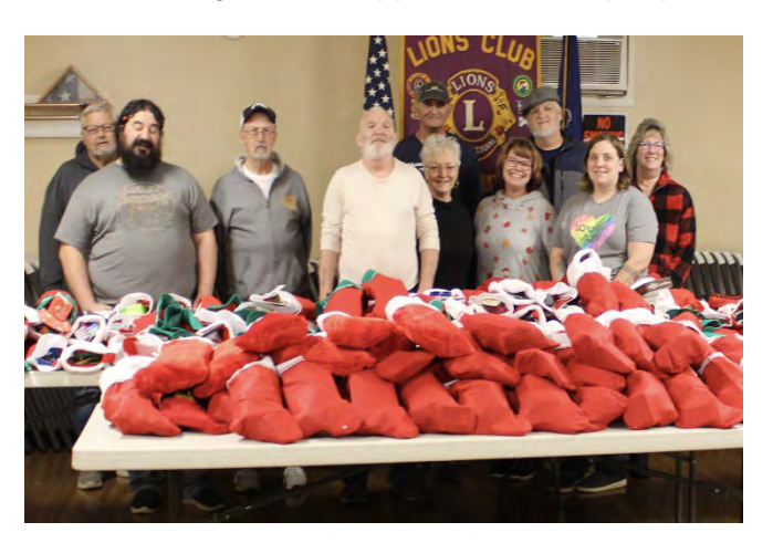
Lower Swatara Lions Club members in front of a small portion of filled stockings collected for the Stockings for Soldiers project.

filled stockings to be shipped to service people.