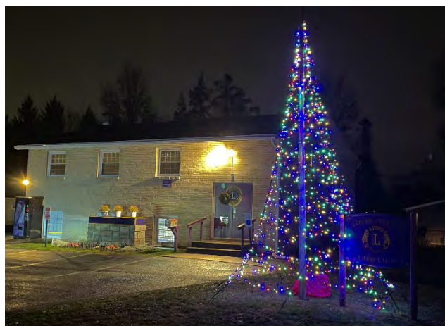
Lower Swatara Lions Club clubhouse is illuminated by their new community Christmas Tree.