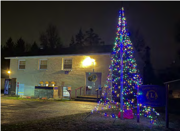
Lower Swatara Lions Club clubhouse is illuminated by their new community Christmas Tree.

Lower Swatara Lions Club held their first annual Community Christmas Tree Lighting Ceremony on Friday December 1, 2023. Our township did not have a community Christmas tree. Fund raising events enabled the Lower Swatara Lions Club to purchase a flagpole tree and install it at our clubhouse. Middletown High School Select Choir supplied carols for the event, and several food trucks were on hand for food and beverages.