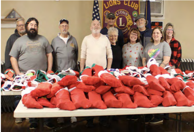
Lower Swatara Lions Club members in front of a small portion of filled stockings collected for the Stockings for Soldiers project.

Lower Swatara Lions Club thanks EVERYONE who contributed to our Stockings for Soldiers campaign. With contributions from the local community, our club members, the Middletown VFW and Susquehanna River Reactors softball/baseball team, we were able to donate 450 filled stockings to be shipped to service people.