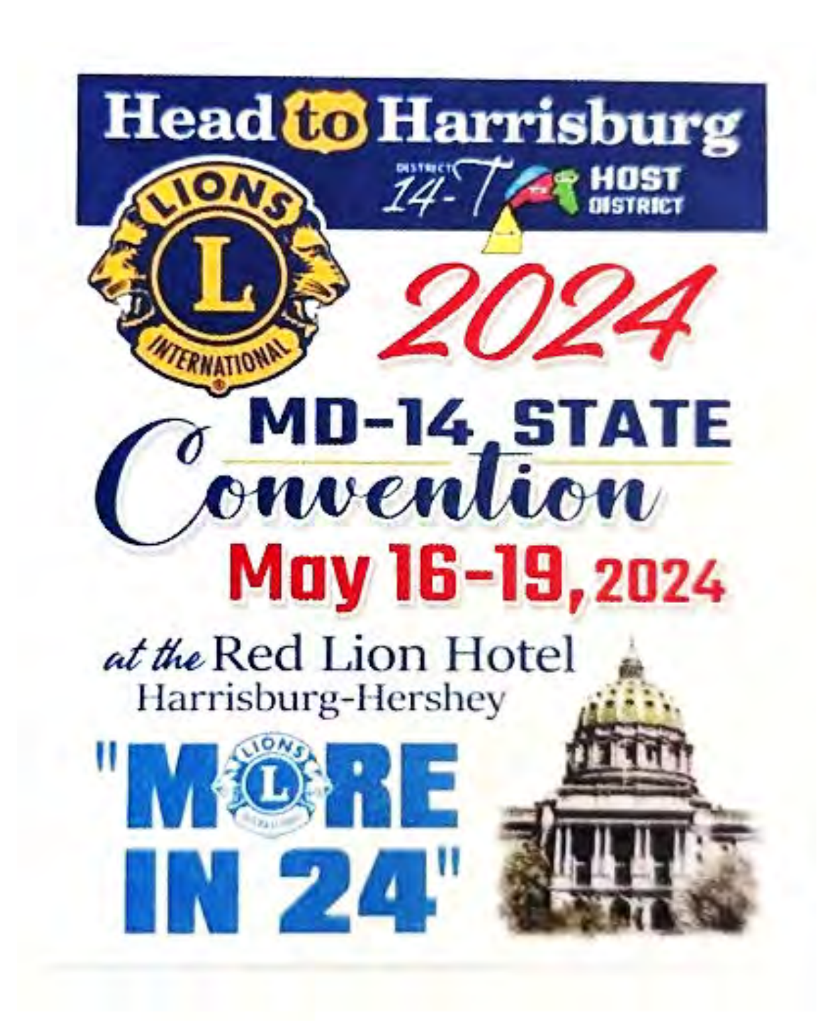
District 14-T is hosting this year's State Convention!

Information/registration packets have been mailed out to all district Lions Clubs. You can also register and pay online by going to palions.org