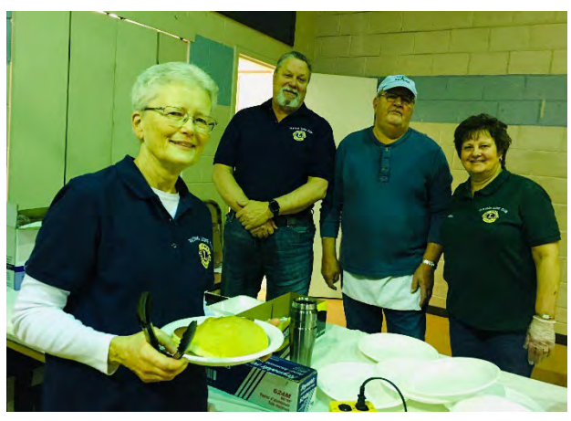
Above: Part of the Pancake crew happy to serve.