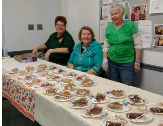
L & Above: East Hanover Lions supported the Central PA Callers Association dance on Sunday, March 17 at the EH Community Center. They provided beverages and food for them to purchase. It was a fun afternoon!