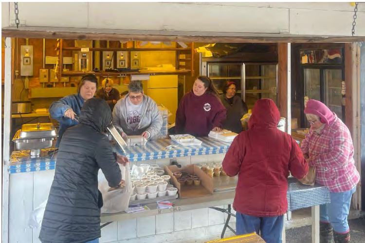
The Richfield Lions Club held a drive thru Fish and Chicken Tender Dinner on March 23, serving around 170 meals!