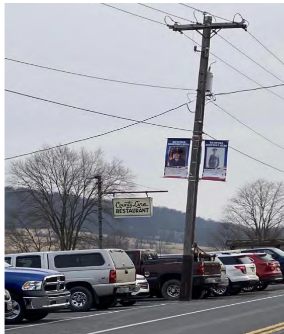
Above: On March 9th members of the Richfield Lions club and a few community members took down the town winter decorations and decorated for the summer months with the hanging of the veterans' banners. What a rainy day!