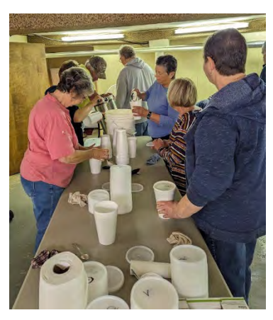
The ice cream packing crew.