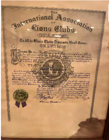
L: Charter for East Hanover