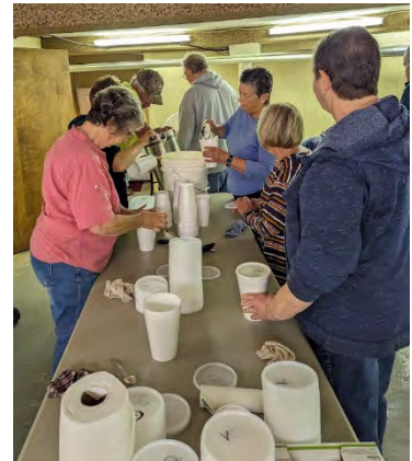
The ice cream packing crew.