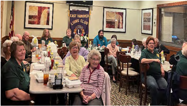
Lion members enjoying the evening!