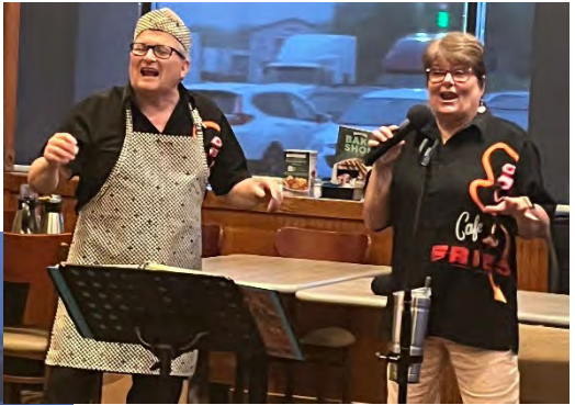
R & Below: Memory Music provided music from the 50's - 80's