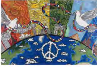
PAST YEAR WINNER

Lions Clubs interested in sponsoring the Peace Poster Contest can order a Peace Poster Contest kit (PPK-1) from the Club Supplies Sales Department at International Headquarters until October 1, 2024.