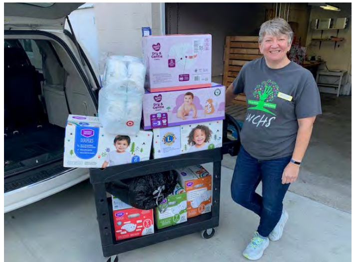
R: Waynesboro Community and Human Services.