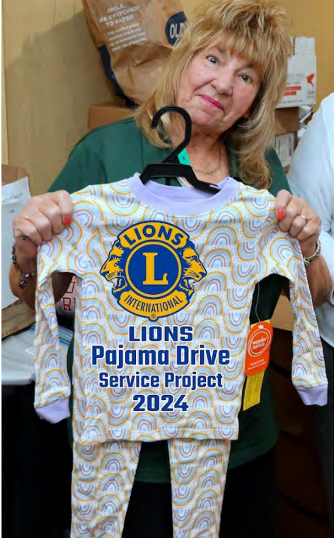
Below: Screenshots from presentation showing how PA Lions provided disaster relief to fellow Pennsylvanians who were victims of the Hurricane Debby floods.