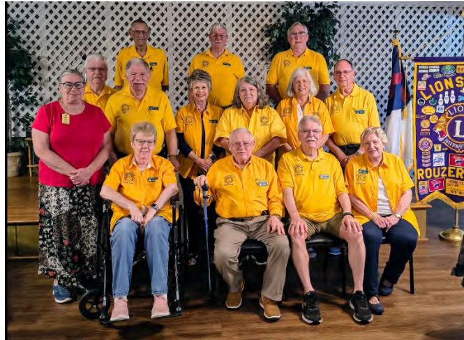
Installation of Rouzerville Lions Club Officers 2025-2026